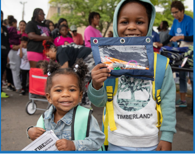
Want to volunteer? Sign up at www.berriencommunity.org/ backpacksforgood or scan the QR code.